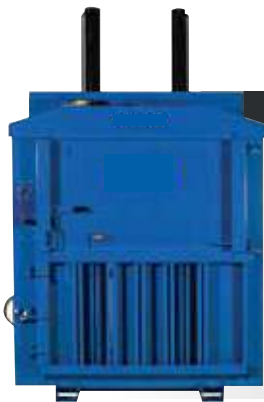
75 Twin Chamber Baling Press