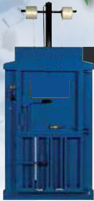
75 Baling Press